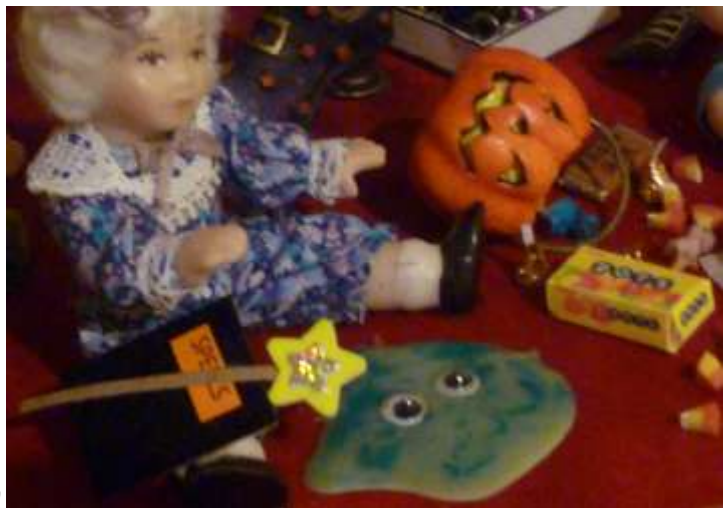
BAD SPELL, YOU NAUGHTY GIRL!