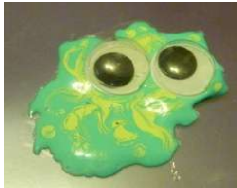
Reversed colors & huge eyes!