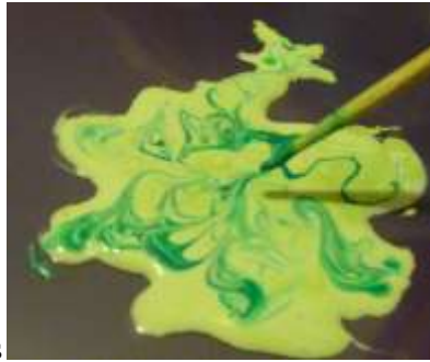
Add darker swirls