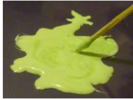
Add base color